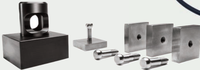
PosiTest AT 50T KIT measures the tensile strength of ceramic tile adhesives.