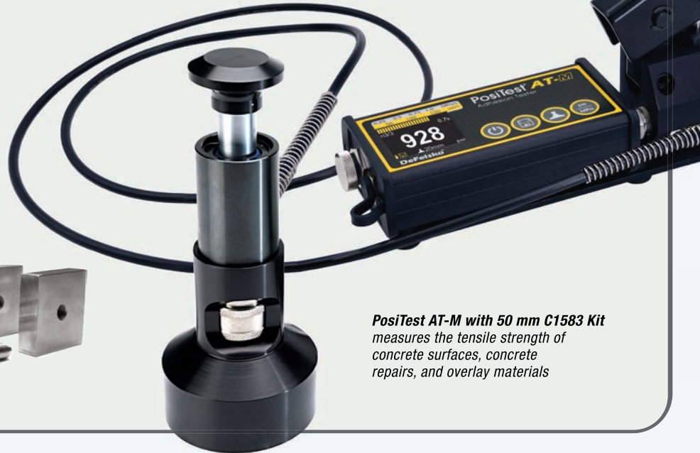
PosiTest AT-M with 50 mm C1583 Kit measures the tensile strength of concrete surfaces, concrete repairs, and overlay materials