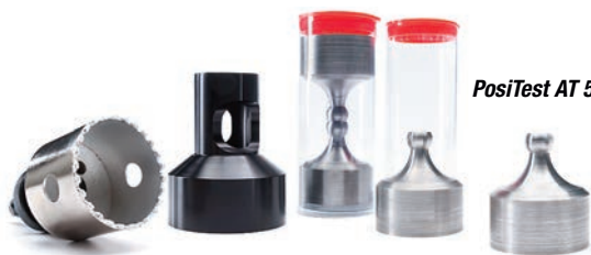
PosiTest AT 50 mm C1583 KIT

Convert your adhesion tester to a different model with our choice of Conversion Kits. Choose from 20 mm, 50 mm, 50 x 50 mm Tile, and 50 mm C1583 kits. Kits include the appropriate stand-off, holesaw (if applicable), and test dollies.