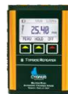
Upgrade Kit A

Unbiblical cable length is specified by the customer up to a maximum of 1,000 m (3,280 ft).