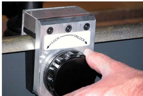
5. Turn locking knob to "LOCK" direction to permanently attach to bench