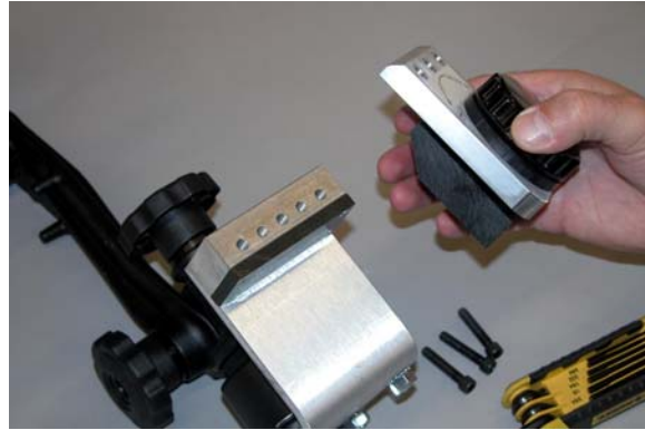
2. Remove front plate of Clamp Assembly