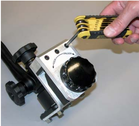
1. Remove screws from front plate of Clamp Assembly