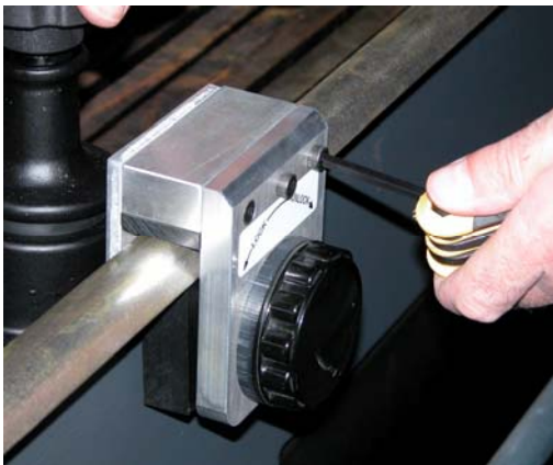
4. Insert and tighten screws into Clamp Assembly

Be sure that you place the Clamp Plate under the lip. You may increase opening by turning knob to "UNLOCK"