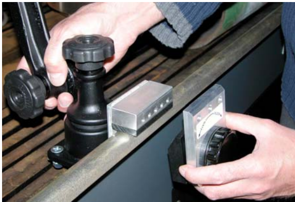
3. Place back of Clamp Assembly to inside of bench rail. Place front plate on outside.(see next instruction)