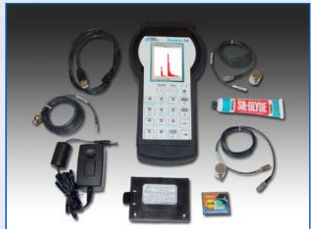
The Pocket AE-2 System comes with hand-held, dual-channel AE unit, two R15α AE sensors, two 1 meter sensor cables, one 2 meter parametric cable with BNC connector and a battery eliminator DC power supply (case not shown).

shipped with R15α (Alpha) sensors and a cable for connecting the sensors to the system. Our line of Alpha sensors are low cost, general purpose sensors and come in many frequency ranges for any application including R3α, R6α, R12α, R30α, R50α, and WSα. These sensors are single ended, high sensitivity sensors.